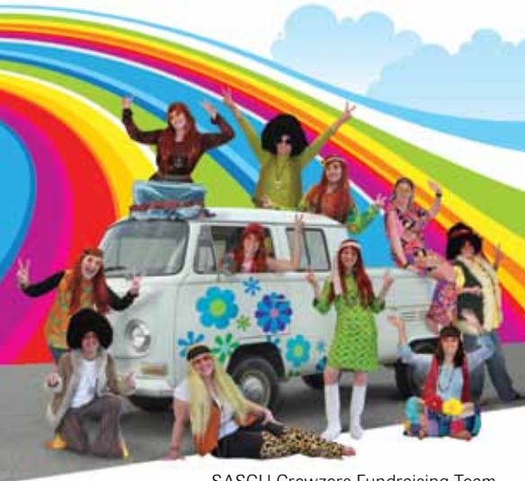
SASCU Crewzers Fundraising Team