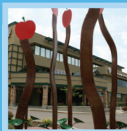
Salmon Arm Branch

Sorrento Branch Sorrento Plaza Shopping Centre Trans Canada Highway Sorrento, BC Features: 24 hours / Deposit Taking