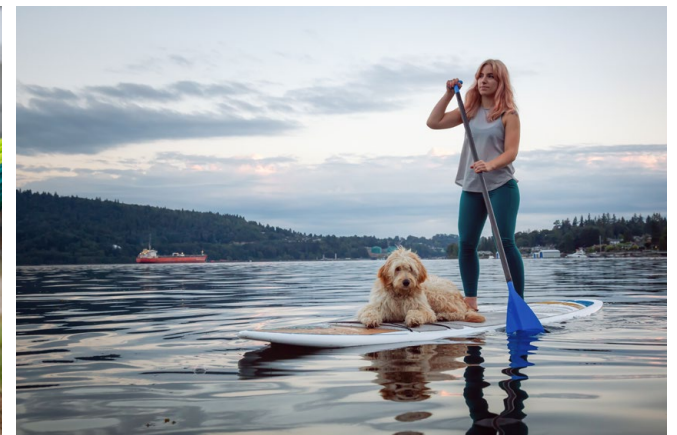
Top: Enderby, BC. Image Source: Viktoria Haack. Bottom Left: Family at Canoe Beach. Source: Viktoria Haack. Bottom Right: Paddleboarding Shuswap.