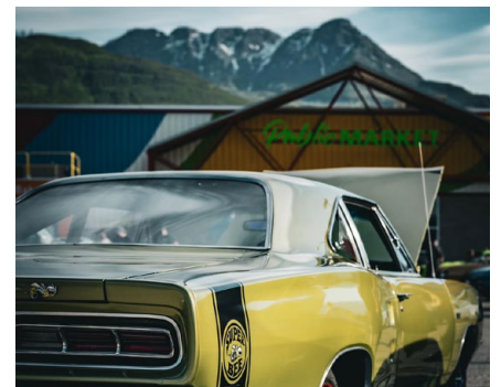
Left/Right Top: Salmon Arm Farmer's Market. Right Middle: Marionette Winery. Right Bottom: Lakeview Cruise In, Salmon Arm.